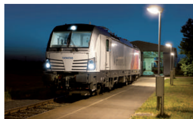
Wheelsets for the most powerful locomotive

GH-BONATRANS GROUP is a benchmark in the Locomotive segment: