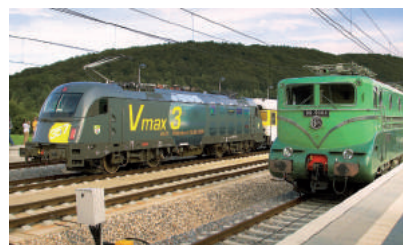
Wheelsets for the fastest locomotive

The more difficult the task, the higher our performance